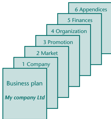
Contents of business plan

Here is a brief description of the contents.