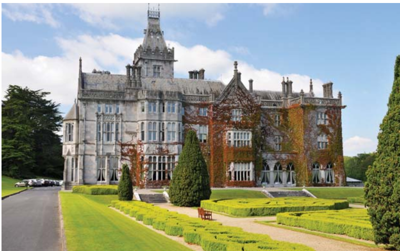
Castle Hotel Adare in Ireland