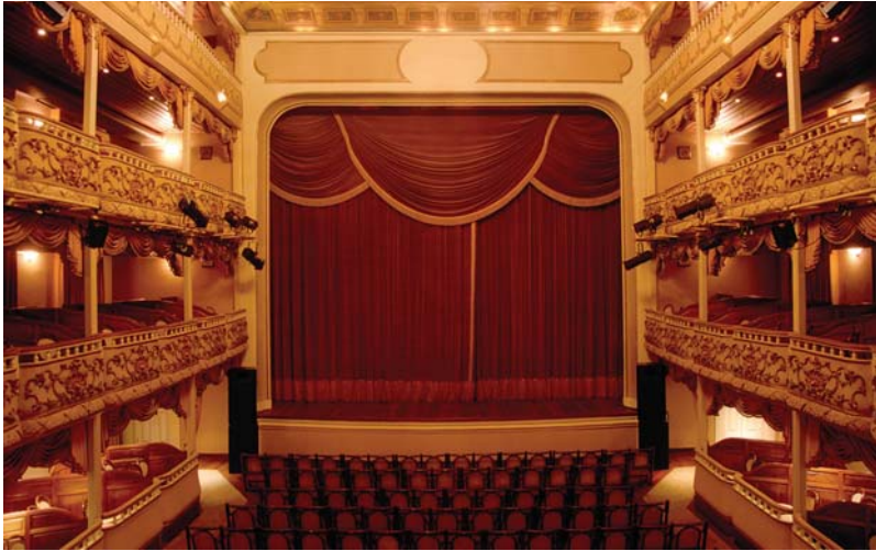
Pine and Gilmore's book bears the telling name The Experience Economy: Work Is Theatre & Every Business a Stage