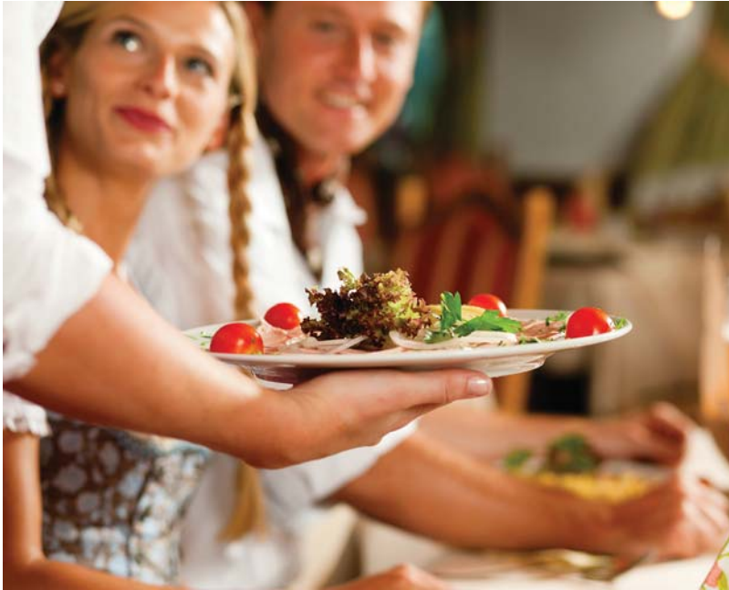
The optimal combination of accommodation, food, drink and interaction?

many key questions we need to answer to successfully manage hospitality experiences. Again, the answers require insights from other fields than just management science.