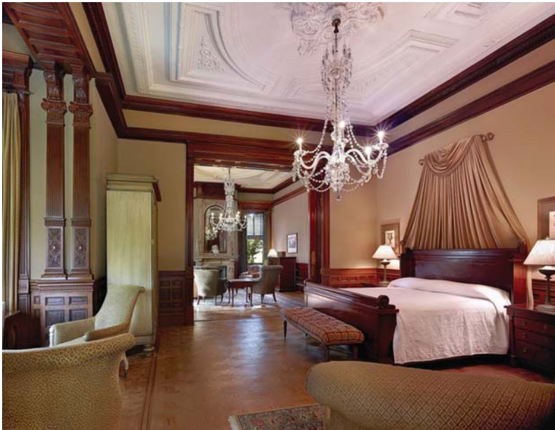
Interior of the Wentworth Mansion