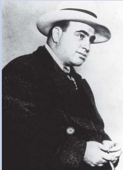
Al Capone: the godfather of hospitality?