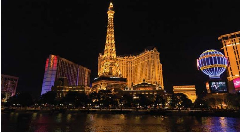
Hospitality as a means of making money?

it being an economic transaction. Goodwill, as the Greek proverb on the first page of this chapter suggests, is all very nice, but, ultimately, we are in it to make money.